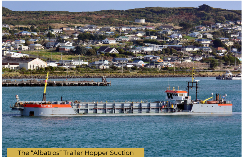
The "Albatros" Trailer Hopper Suction Dredge moving through Bluff Harbour

Once the "Albatros" dredging campaign is complete, we will focus on dredging the remaining material in the entrance channel. As with last year, we intend to undertake this work using a backhoe dredge, given the harder material we expect to encounter in the channel. The exact date for this work is unknown but will likely be towards the end of July.