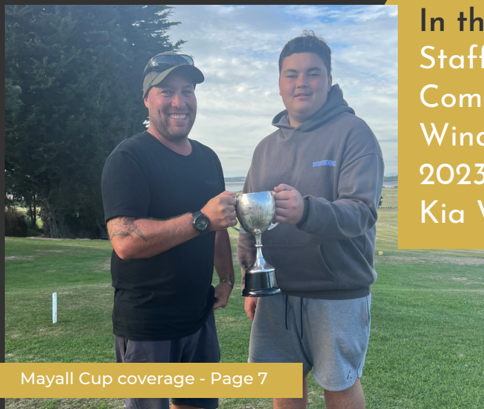
Mayall Cup coverage - Page 7